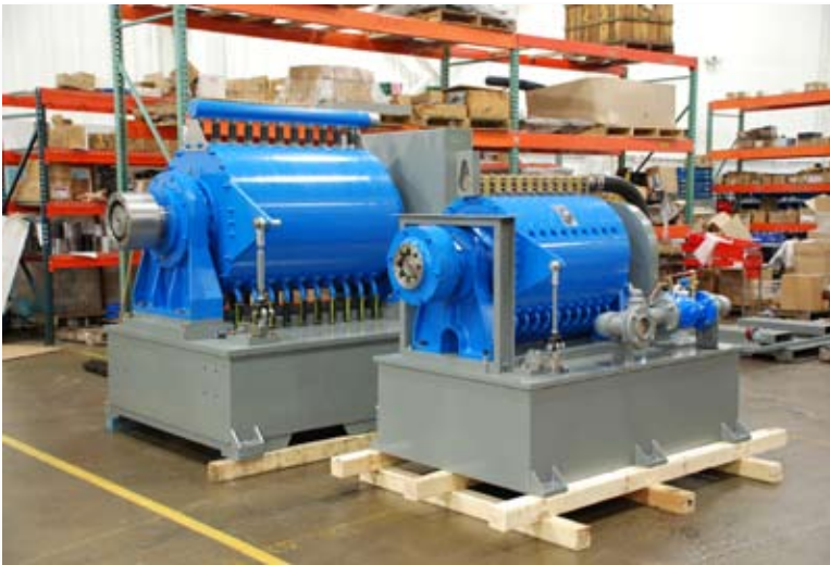
H3610 shown with 45X10